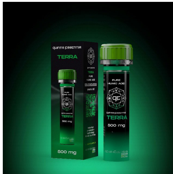
Figure 3. Dietary supplement “Quinta Essentia” TERRA for human consumption.

Over the past 7 years, international comprehensive and practical studies have been conducted in the field of impact and improving the efficiency of the use of humic substances in agriculture, animal husbandry, and human use. All products for agriculture and food additives for humans are certified in the European Union and are impressed with their functionality, quality, and safety. During 2023–2024 it has been shown that ProtoHumiX® in plant crop production accelerates seedling germination and contributes to the development of a powerful root system of Chrysanthemum plants. The cuttings (seedlings) were soaked for 60 minutes in water solution of ProtoHumix® and sprayed one time after rooting with a working solution of 0.2 g/l of water (without Cl). The second spraying of plants was carried out during the beginning of budding. Third spraying is carried out normally before flowers starting to bloom (Figure 4).