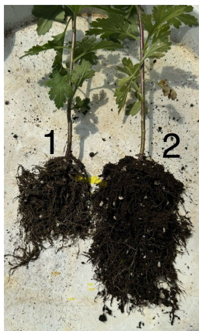
Figure 4. Chrysanthemum roots system development. 1: control plant; 2: ProtoHumix® treated. Picture on 52 days of cultivation.

Our investigations showed that humic substances can only be obtained by extraction from target-relevant sources and can be further purified to obtain a substance of pharmacological (reference) purity \geq 95\% (or not to be purified at all and can be used subsequently in various sectors of the farming, industrial sectors and human use; Tables 1, 2).