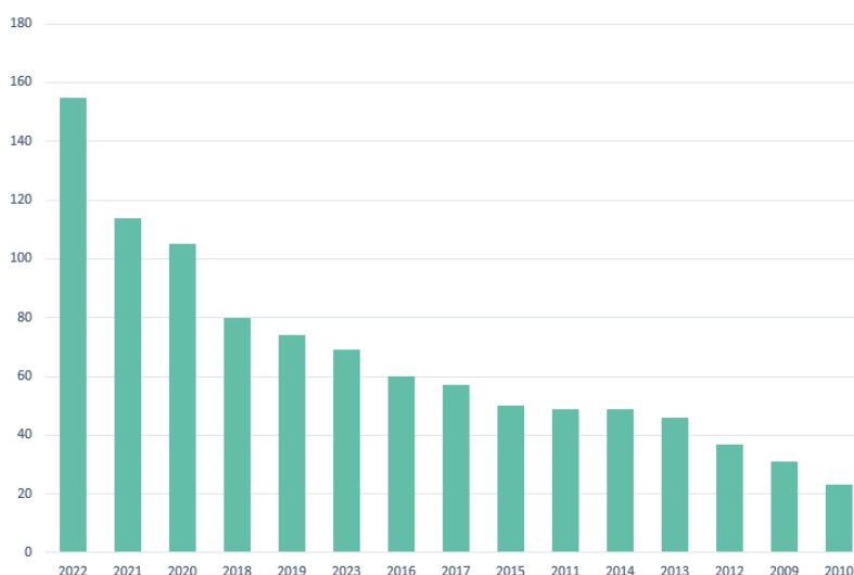
Figure 2. Publication numbers of research on satellite monitoring for forest fires in the Web of Science Core Collection database from 2009 to 2023. (The data obtained up to 20 July 2023.)

The results of the data network visualization show that satellites used more in forest fire satellite monitoring studies are Landsat, MODIS, Sentinel, etc., which all have obvious advantages and limitations in forest fire detection. Landsat provides detailed information on the spatial distribution of fires, but has a long revisit period (every 16 days) and a small geographical coverage area. MODIS has channels and products specifically designed for fires, with a resolution of the highest 250m and high detection accuracy, but the temporal resolution is not high enough to detect fires in time and then alarm it. Moreover, the methodology for satellite monitoring of forest fires shown in Figure 2 involves more terms such as “machine learning”, “time series” and “spectral indices”. It indicates that the research hotspots in forest fire monitoring focus on the introduction and development of Deep Learning in forest fire monitoring (machine learning), the improvement of the temporal efficiency of medium- and high-spatial-resolution satellites and sensors (time series), the improvement of monitoring algorithms for forest fires using the information of infrared channels (spectral indexes), and so on.